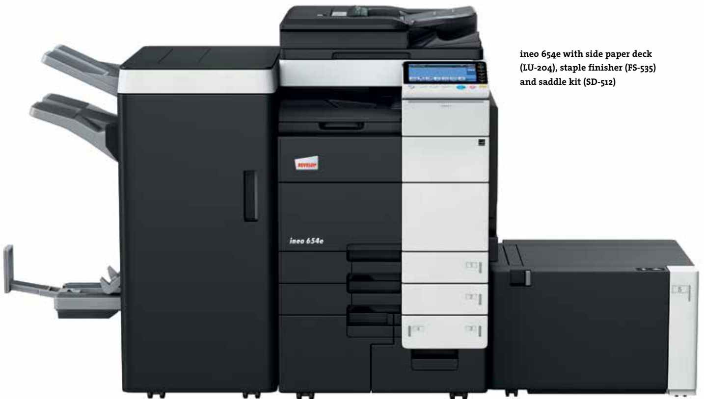
ineo 654e with side paper deck (LU-204), staple finisher (FS-535) and saddle kit (SD-512)

Viruses, Trojan horses, hacker attacks: these days, no business can afford to ignore the challenging issue of IT security. That's why the ineo 654e is certified to ISO 15408 EAL 3, the industry's security standard for multifunctional systems. What's more, it also comes equipped with numerous data-security features such as IPsec encryption, which ensures secure communication channels for all documents passing through your company's network. There is no danger of confidential documents or data getting into the wrong hands either since access to the system can be restricted to authorised users by means of the standard hard-disk encryption kit and authentication technology. This way, we ensure your sensitive data stay secure – now and in future.