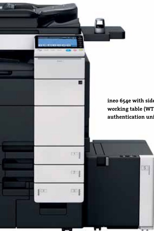
ineo 654e with side paper deck (LU-301), working table (WT-506) and finger vein authentication unit (AU-102)

The ineo 654e prints and copies at 65 A4 pages per minute (ppm). That means your staff can leave this machine to get on with any high-volume job while they carry on with their daily office work. In the multi-user environment of a departmental device or centralised office location and at an in-house printshop, this will also eliminate job queues, or at least shorten waiting times. Since this machine prints or copies in duplex mode at full speed, it will also save you money by reducing your paper consumption on high-volume jobs.