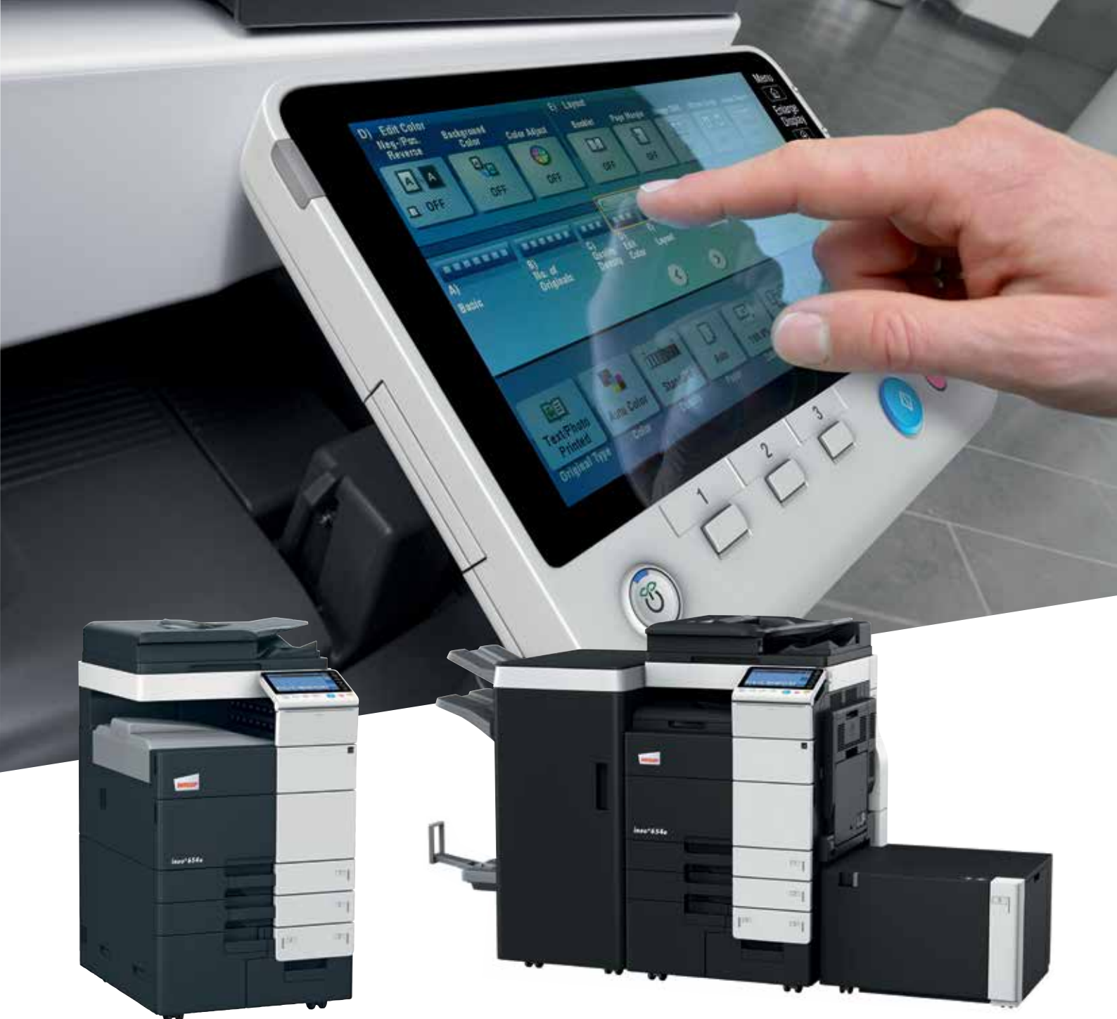
ineo+ 654e with output tray (OT-503)